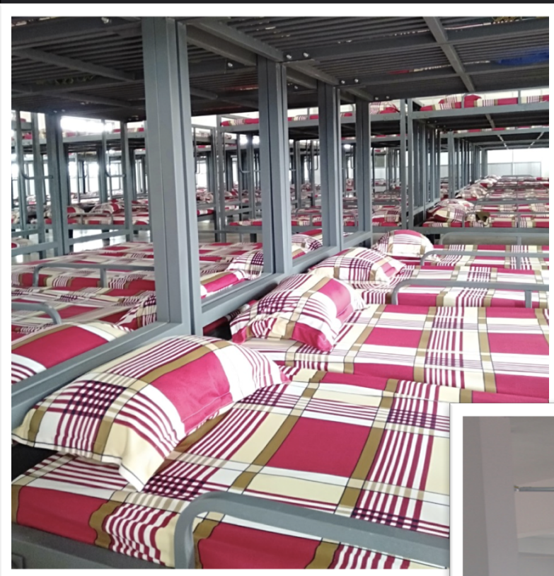
Blessing of the New Dinning Hall & Dormitory