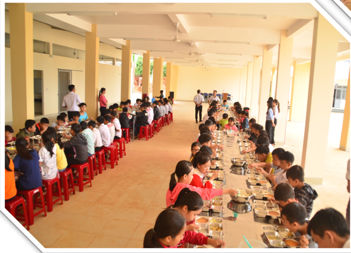
The playground being used as multi-purpose hall