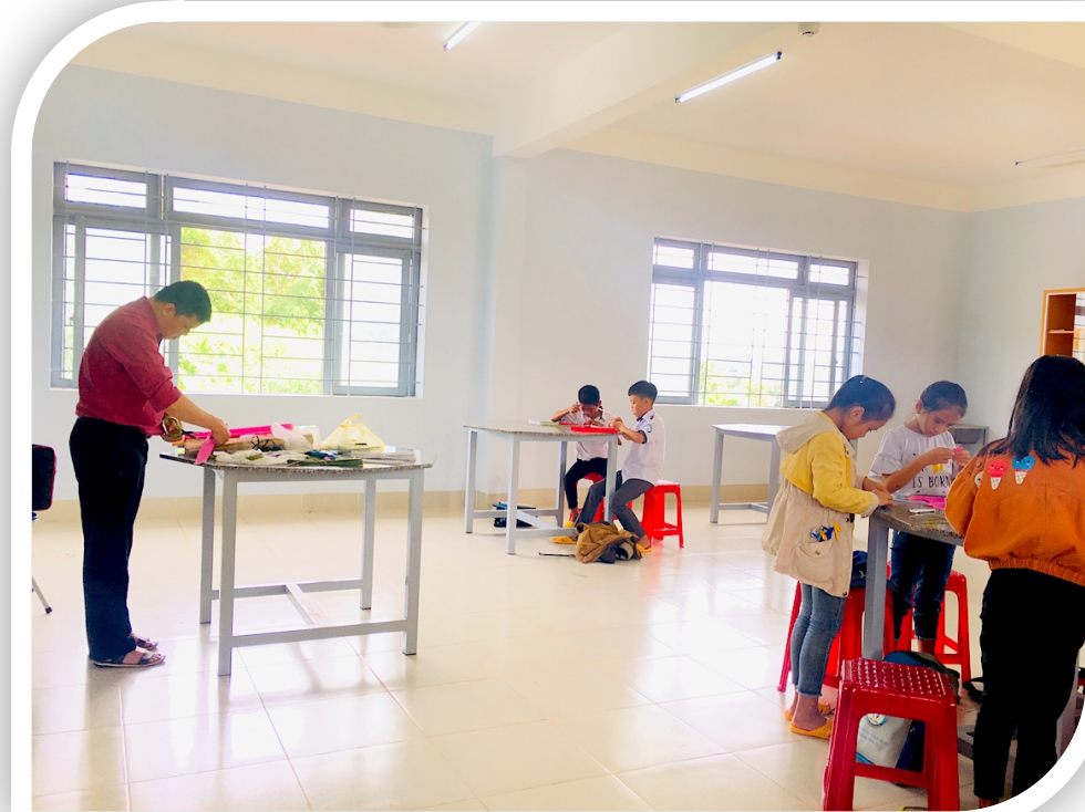
Everywhere can be used as multi-purpose for school activities or resting area