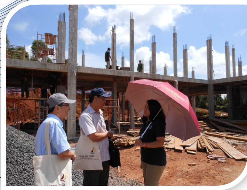
Welcoming guests, project managers and coordinators in 2017