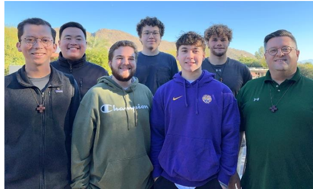
Our SFNO Vocation team and Contacts on the Advent Retreat in sunny Scottsdale recently