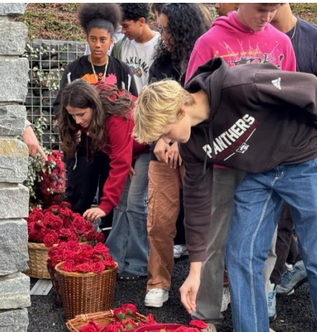
SMCHS students offer roses at the Shrine of Our Lady of Guadalupe on campus