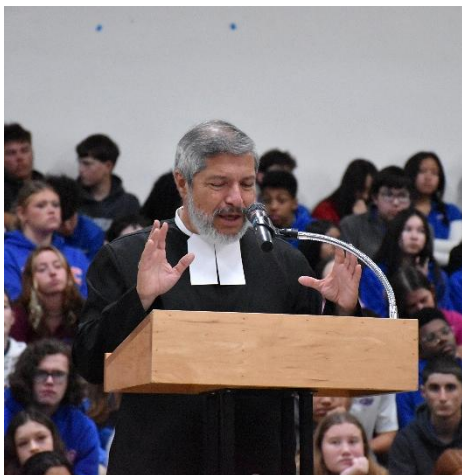
Addressing the student body of Christian Brothers HS during a prayer service