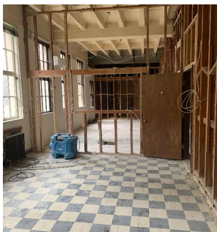
All plaster removed from 1 st floor walls and ceiling in two future breakout rooms