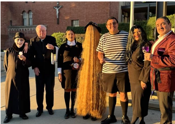
Shout out to Cathedral LA Brothers and staff who committed completely to being The Adams Family this Halloween