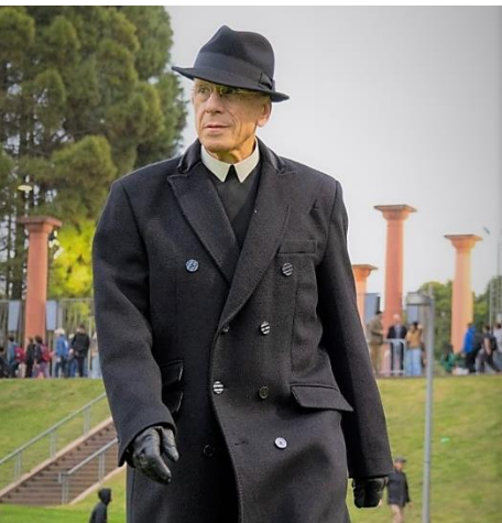
SHCP's dapper football chaplain walking with the team, hat askew, onto Kezar Field