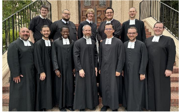
Brothers in Formation regional gathering was at Mont La Salle last weekend. It was a joy to have them on the property.