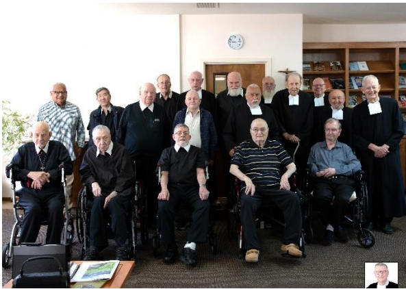
The Holy Family Community gathered recently for the first of their Community Annual Program (CAP) discussions