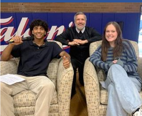
Was interviewed by two La Salle Milwaukie students during an assembly