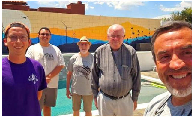
The sun was plenty hot in Bermuda Dunes, CA, where the CHSLA community held their two-day CAP meetings