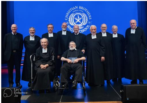
Eleven Brothers (2 alumni) joined in the 150 th Anniversary Celebration of Christian Brothers HS in Sacramento